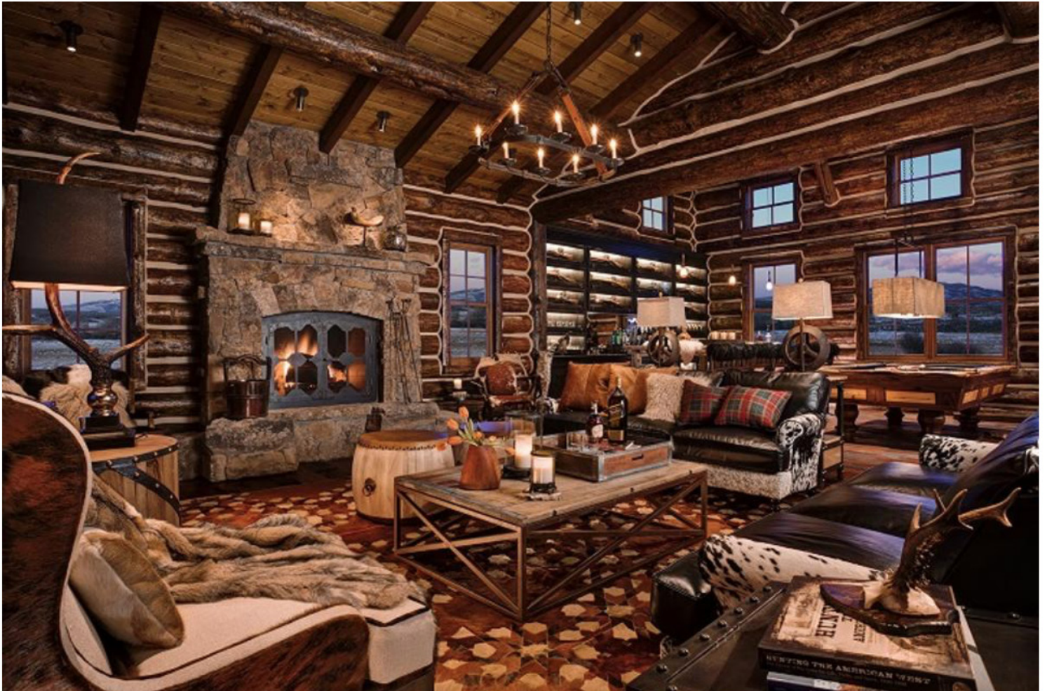
The Great Room of Magee Homestead.

Another advantage is proximity to Jackson for excellent restaurants such as Rendezvous Bistro for its well prepared span the globe menu. And to the Tetons for those rugged, True West views.