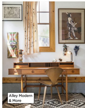
Alley Modern & More