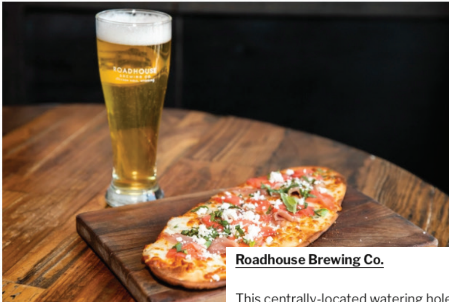
Roadhouse Brewing Co. JAY NEL-MCINTOSH